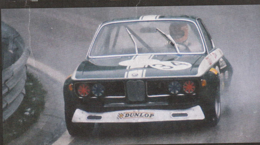
1972 Salzburgring, European Touring Car Championship